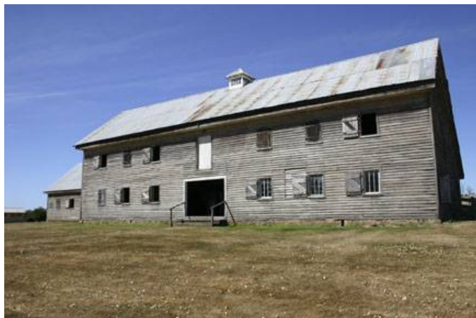
Woolshed, Woolmers Estate.

Mr O'Byrne said obtaining World Heritage recognition of Australia's convict past is a significant milestone.