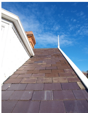
The new slate roof.