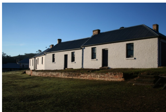
Darlington Probation Station, Maria Island.

The next edition of the e-bulletin will contain in-depth detail about the listing, including responses from each of the five sites, to this fantastic news.