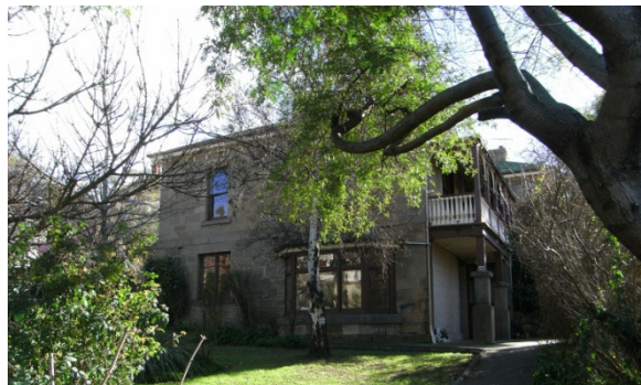
The former rectory on Goulburn Street, West Hobart