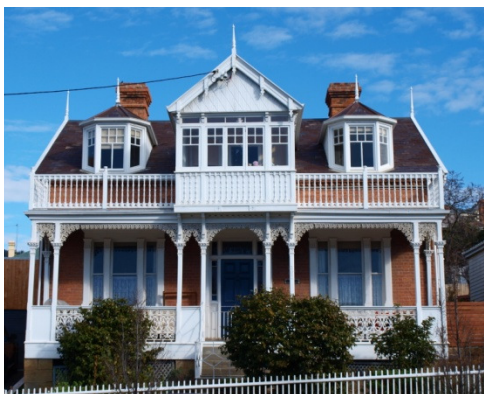
Woodbine in North Hobart.