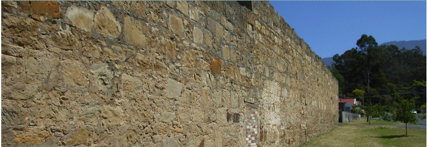
External wall at the Female Factory, South Hobart.